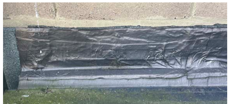
Examples of Sylglas™ Flashing Tape applications from the early 1990's, still in service. (photographed in 2024)