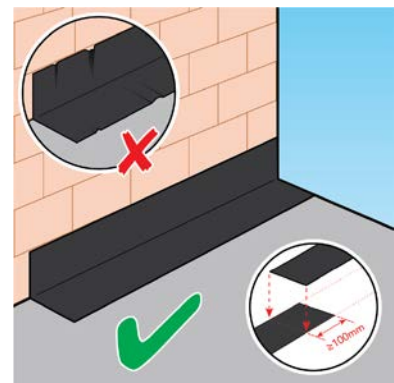
3. CONTINUE TO COMPLETION