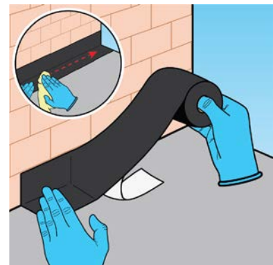
2. TAPE POSITIONING & FIXING